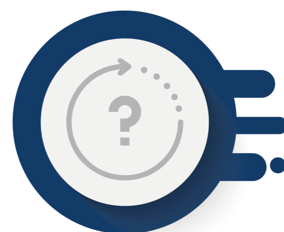
TOPICS AND QUESTIONS THAT MAY BE SENSITIVE