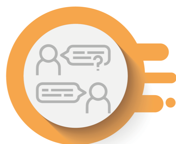
THE RELATIONSHIP BETWEEN THE INTERVIEWEE AND THE INTERVIEWER